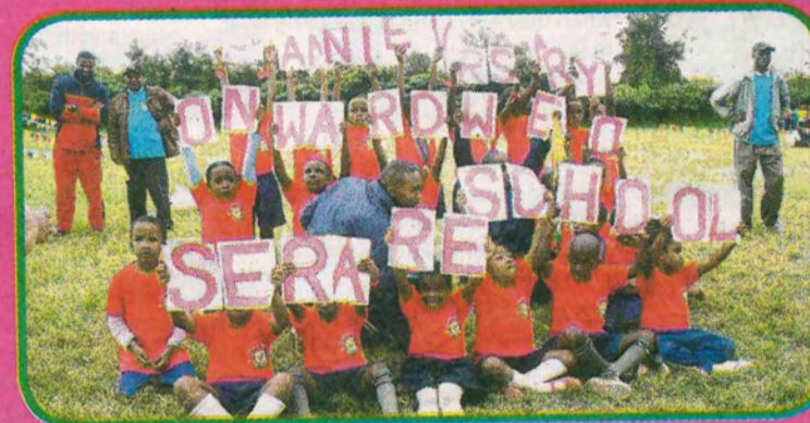
Kindergarteners of Serare School having their fun at the event.