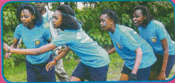
Students of Serare School in Ngong play during the school's sports day. The event is held annually.